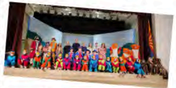
Missoula Children's Theatre Residency

Make checks payable to Elgin School. Mail or drop off this completed form with your check to Elgin School. The school staff will provide you with a receipt verifying you have contributed to an eligible fee-based extra-curricular activity.