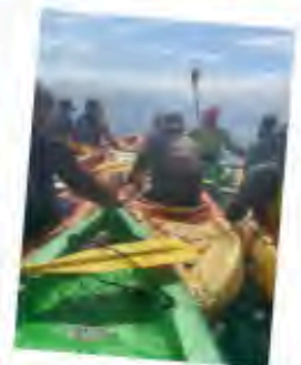
Marine Biology Club

Ready to donate today? Just send in this form with your donation to: