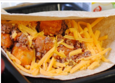
Beef & Potato Wrap