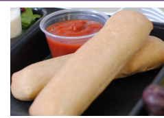
Pepperoni Bosco Sticks