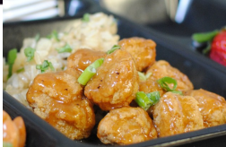
Sesame Popcorn Chicken