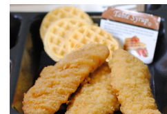
Chicken & Waffles