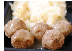
Turkey Meatballs with Gravy