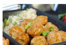
Sesame Popcorn Chicken