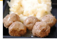
Tukey Meatballs w/Gravy