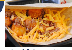
Beef & Potato Wrap