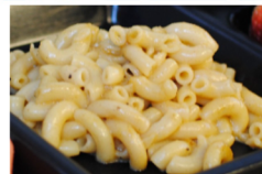
Macaroni & Cheese