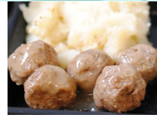
Turkey Meatballs with Gravy