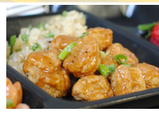
Sesame Popcorn Chicken