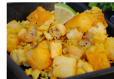
Meat & Potato Pilaf