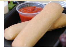
Pepperoni Bosco Sticks