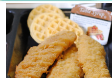
Chicken & Waffles