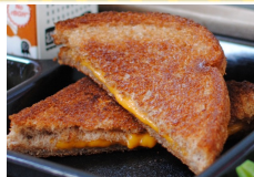
Grilled Cheese & Tomato Soup