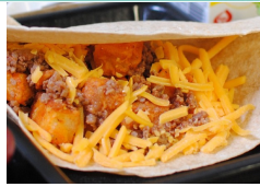
Beef & Potato Wrap