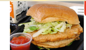
Chicken Patty Sandwich