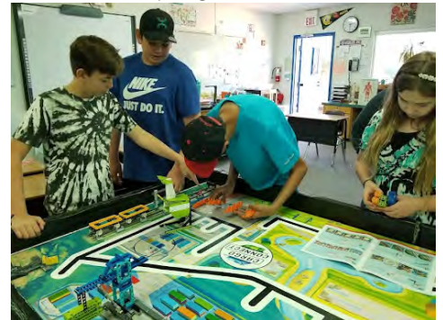
Attempting a robotics mission