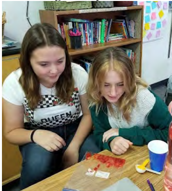
Extracting DNA from strawberries.